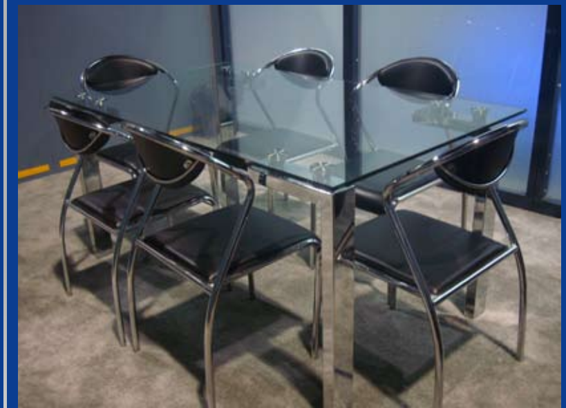
RECTANGULAR CONFERENCE TABLE 30"H x 36"W x 60"D PICTURED WITH BLACK/CHROME CHAIRS (RENTED SEPERATLY)

TRIANGLE GLASS TOP TABLE 35"H x 35"W x 35"D PICTURED WITH BLACK/CHROME CHAIRS (RENTED SEPERATLY)