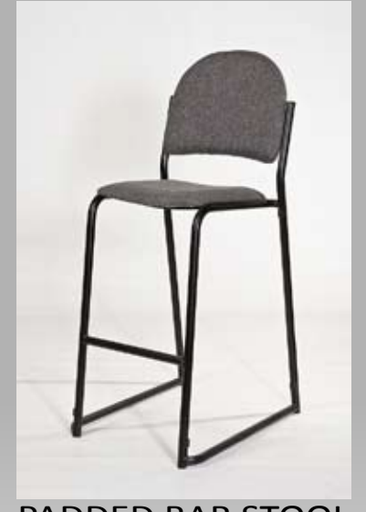
PADDED BAR STOOL SPECKLED GRAY/BLACK