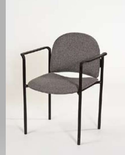
PADDED ARM CHAIR SPECKLED GRAY/BLACK