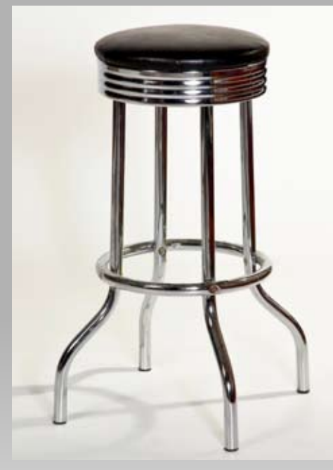
SODA FOUNTAIN BARSTOOL 30"H x 17"W x 17"D AVAILABLE WITH A BLACK OR RED SEAT

SWIVEL BARSTOOLS WITH CURVED BACK 32.5"H x 22.5"W x 18"D AVAILABLE IN WHITE OR BLACK