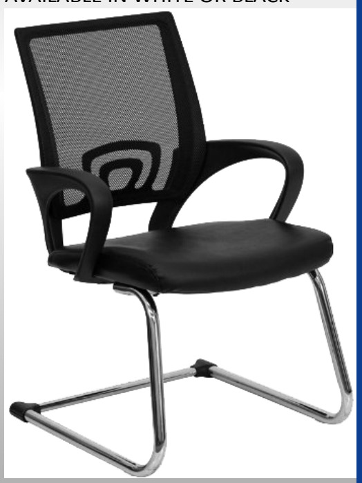
LEATHER OFFICE CHAIR WITH MESH BACK 34.75"H x 22.75"W x 24"D

SWIVEL BARSTOOLS WITH CURVED BACK 32.5"H x 22.5"W x 18"D AVAILABLE IN WHITE OR BLACK