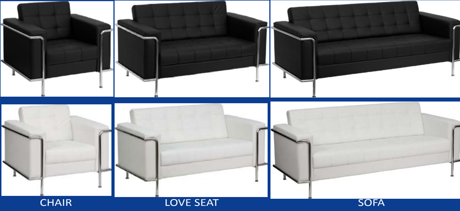
32"H x36"W x 33"D