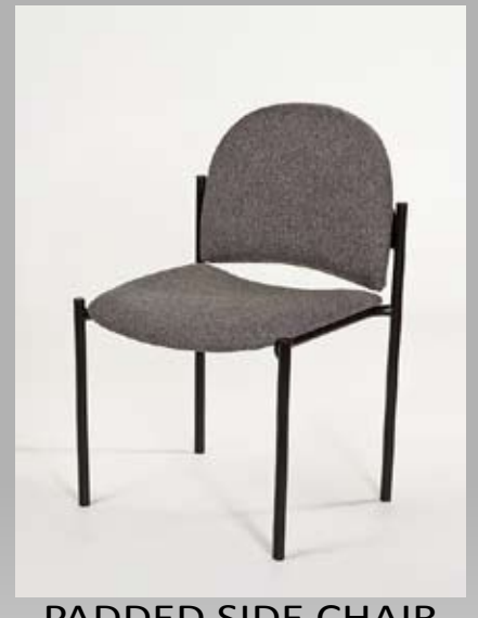
PADDED SIDE CHAIR SPECKLED GRAY/BLACK